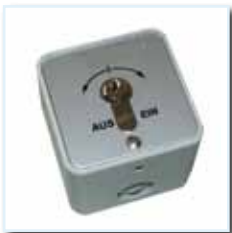
Key contact KT 3-2 UP / AP (ON / OFF)