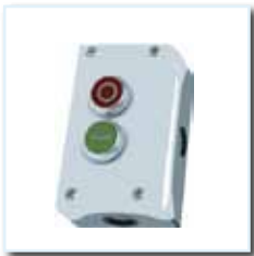
Push touch contact KM 2, AP, double