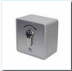
Key contact KT 3-1 AP (single impulse), surface mounting