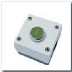
Push touch contact KM 1, AP, single