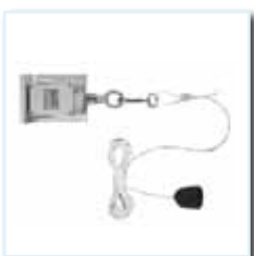
Pull cord contact with knob ZT, AP