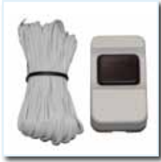
Touch contact with 5 m connection cable