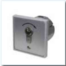
Key contact KT 3-1 UP (single impulse), concealed mounting