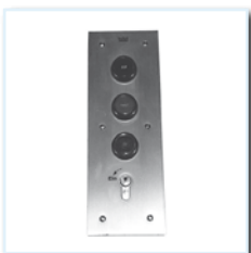
Key contact KT 7 UP / AP, with 3 additional push buttons, ON / OFF switching by profile cylinder