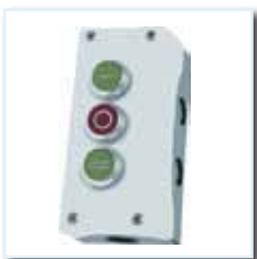
Push touch contact KM 3, AP, triple